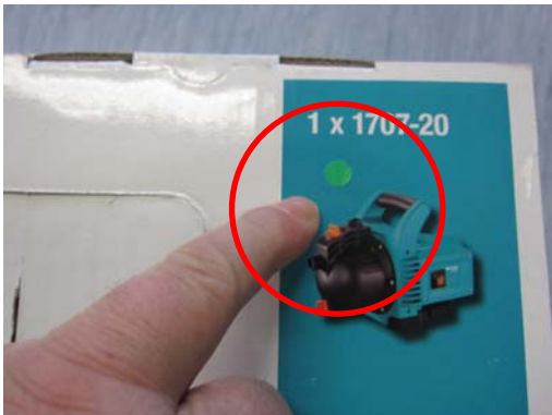
green sticker on the box