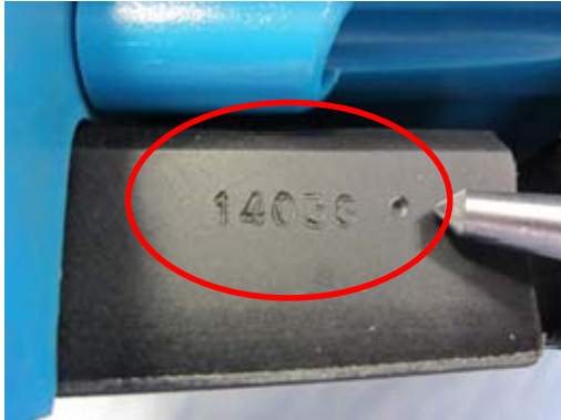
mark beside the index